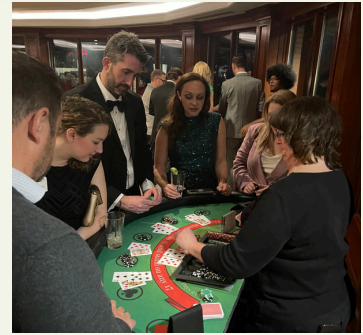
An intense game of blackjack from the 2024 Casino Night

More information about Casino Night can be found at omahadistrictds.com/philanthropy .